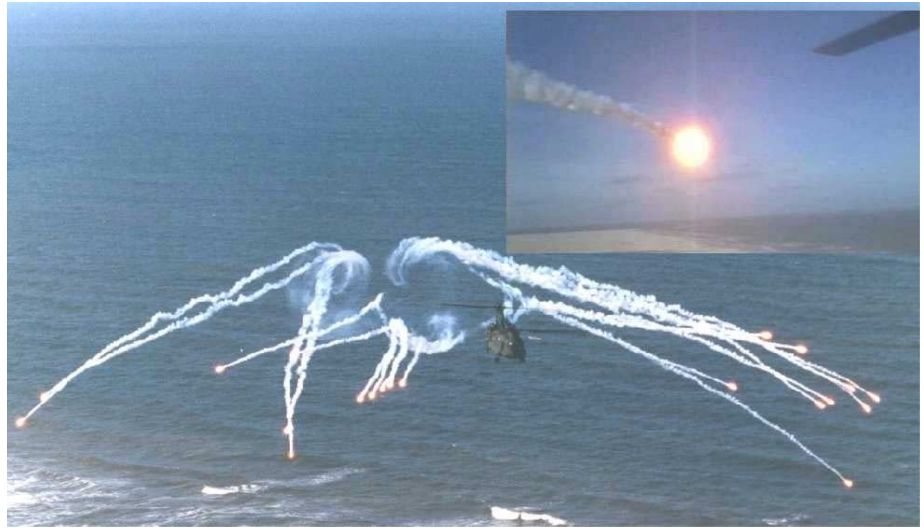
Fig. 2: Flare separation trials on RNLAF CH-47D Chinook