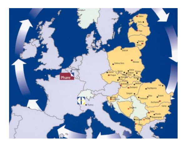
Fig. 1. Target countries for JAR training courses

The international course delivery started in 2003 with the support of ECAC (European Civil Aviation Conference). Around 100 CAA experts from Central and Eastern European countries completed training in Brno in the Czech Republic.