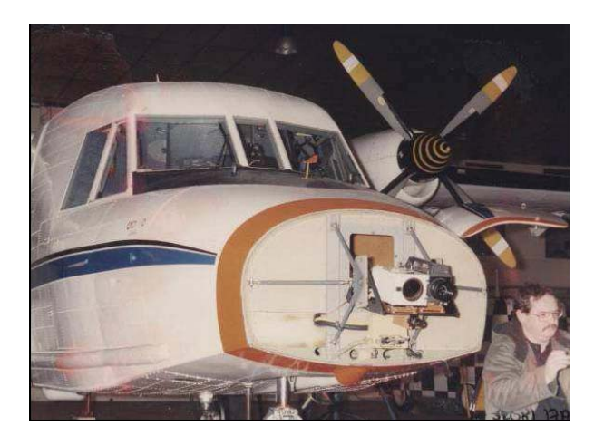
Fig. 4. Example of sensor installation.

The first functional tests will be done in the second manned campaign. This will test the MIDCAS demonstrator system, incl sensors and processing equipment with the initial basic S&A functionality implemented.