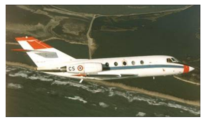
Fig. 5. Different intruder aircraft will be used