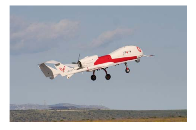
Fig. 1. The goal of MIDCAS is integration of UAS in non segregated airspace

MIDCAS is a 4 year long European project funded by Sweden, France, Germany, Italy, and Spain, managed under the umbrella of the European Defence Agency and achieved by a consortium of 13 companies from the 5 above nations. Started in September 2009, its goal is to demonstrate the baseline of acceptable solutions for the critical UAS self separation and midair collision avoidance functions which are considered as the most challenging issues towards seamless integration of UAS in non segregated airspace.