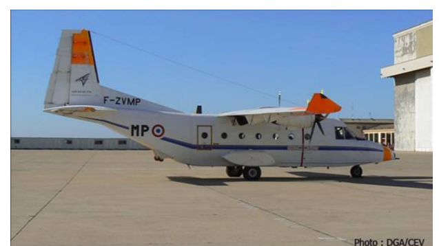
flight profile close to a MALE UAV