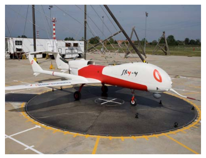
Fig. 6. Alenia Sky-Y UAS

Two UAS flight test campaigns are planned with functional updates possible between the two campaigns. Presently both campaigns are planned to be performed at Vidsel Test Range in Sweden.