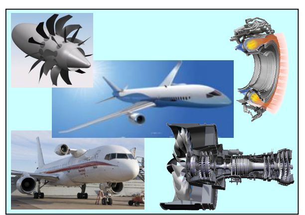
Fig. 3: Sampling of CLEEN Technologies

This year the FAA awarded five-year agreements to Boeing, General Electric, Honeywell, Pratt & Whitney and Rolls-Royce. These companies will match or exceed all Federal dollars in this cost-sharing program. The total Federal investment is expected to be $125 million, making the total expected overall value of efforts at least $250 million.